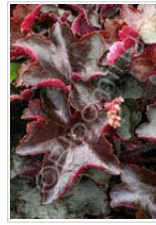
Heuchera micrantha 'Palace Purple'