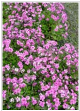
Phlox stolonifera 'Home Fires'