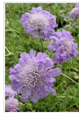
Scabiosa columbaria 'Butterfly Blue'