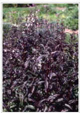
Penstemon digitalis 'Husker's Red'