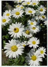
Leucanthemum x superbum 'Becky'