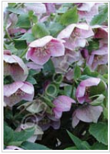
Helleborus x hybridus 'orientalis'