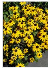
Rudbeckia fulgida 'Goldsturm'