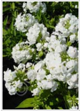
Phlox paniculata 'David'