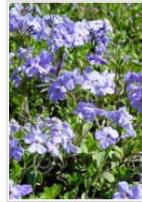
Phlox stolonifera 'Blue Ridge'