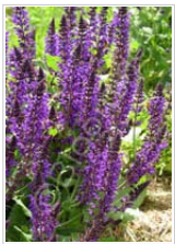
Salvia nemorosa 'May Night' ('Mainacht')