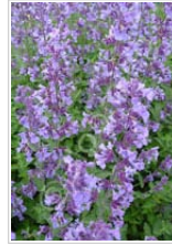
Nepeta x faassenii 'Walkers Low'