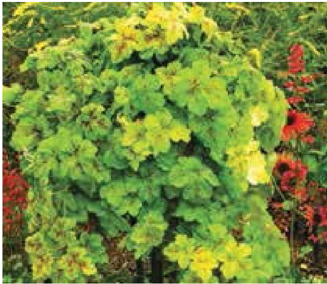
Heucherella 'Yellowstone Falls'