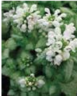
Lamium 'Nancys White'