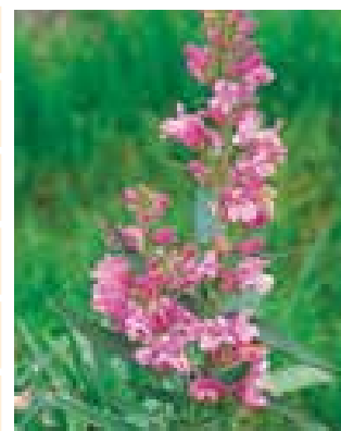
Penstemon 'Riding Hood Lavender'