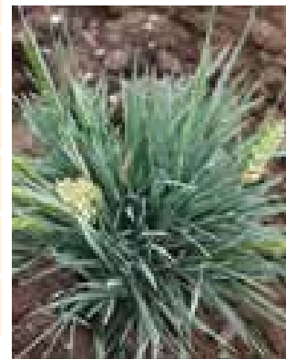
Koeleria 'Tiny Tot'