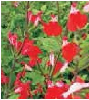
Salvia 'Hot Lips'