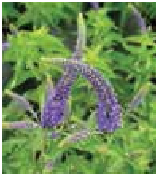
Veronica 'Darwins Blue'