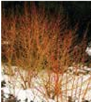
Cornus 'Midwinter Fire'