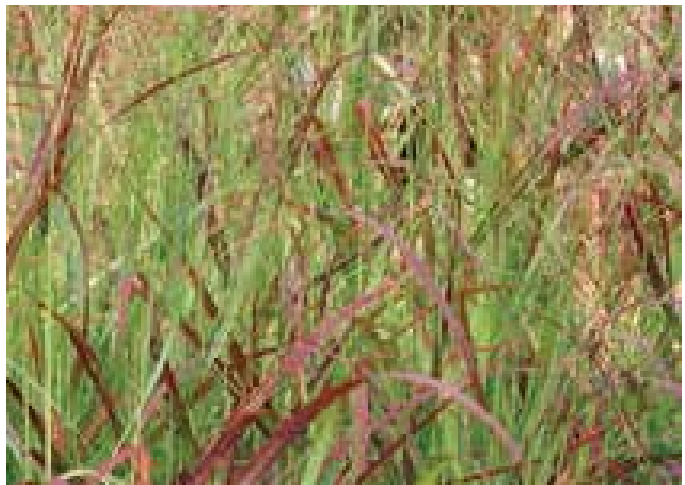
Panicum v. 'Haense Herms'