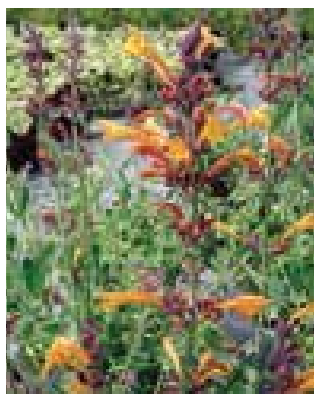
Agastache 'Apricot Sunrise'