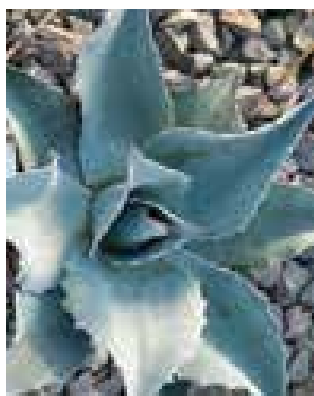
Agave 'Frosty Blue'

If you need to find plants that are tolerant of seriously windy situations, the best place to look is natural environments where wind is prevalent. Mountainous regions, coastal areas and other exposed regions where wind can be stiff offer solutions for windy garden areas. Choosing plants adapted to the condition will result in a beautiful landscape that will thrive despite the steady and sometimes brisk, desiccating conditions.