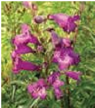
Penstemon 'Papal Purple'