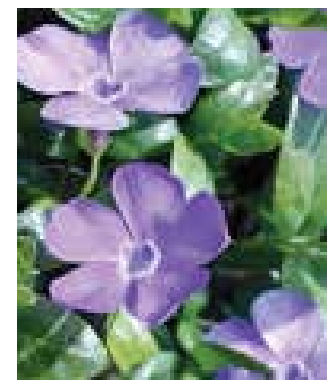
Vinca minor 'Bowl's Variety'

** These plants also provide Erosion Control